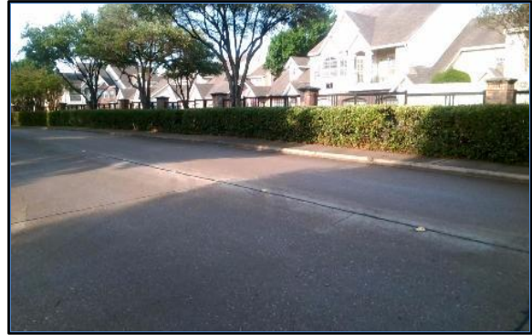
Corner 4 No Ramp (4z)