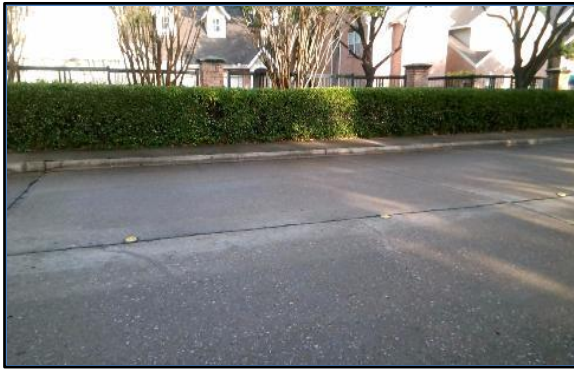
Corner 1 No Ramp (1z)