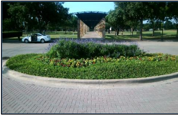
East Median No Ramp (Ez)