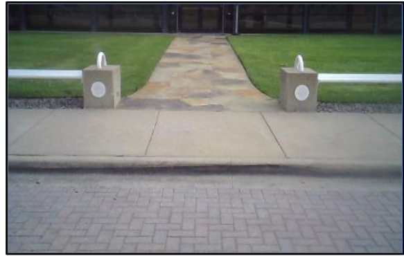
Corner 1 No Ramp (1z)