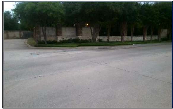
Corner 2 No Ramp (2z)