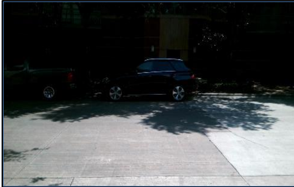
Corner 3 No Ramp (3z)