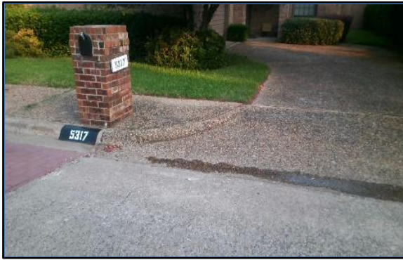
Corner 1 No Ramp (1z)