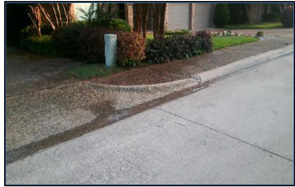
Corner 2 No Ramp (2z)