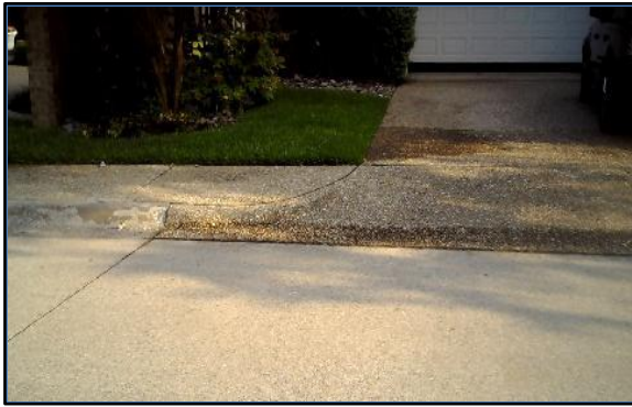
Corner 1 No Ramp (1z)