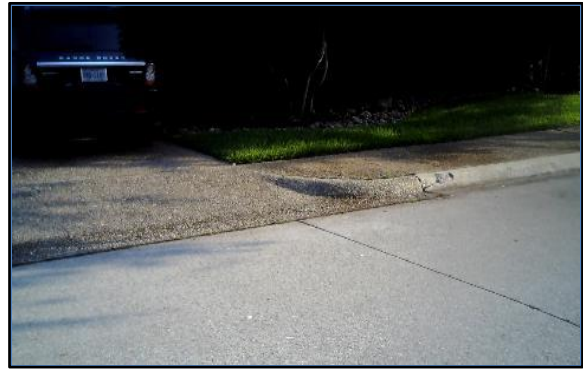
Corner 2 No Ramp (2z)