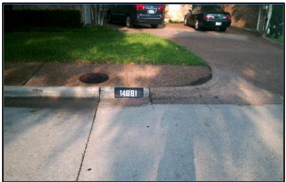
Corner 4 No Ramp (4z)