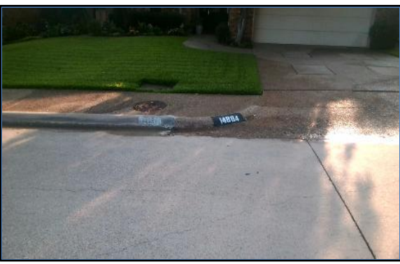
Corner 2 No Ramp (2z)