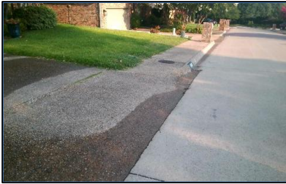
Corner 1 No Ramp (1z)