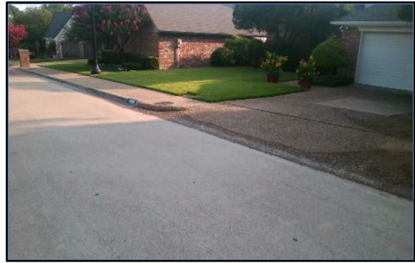
Corner 2 No Ramp (2z)