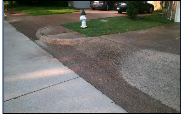
Corner 4 No Ramp (4z)