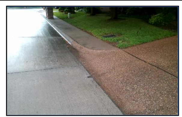
Corner 3 No Ramp (3z)