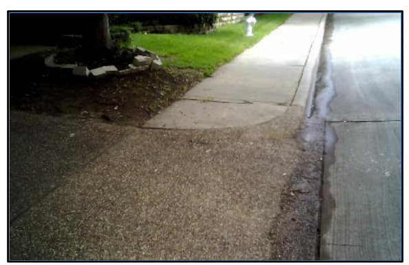
Corner 4 No Ramp (4z)