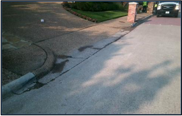
Corner 4 No Ramp (4z)