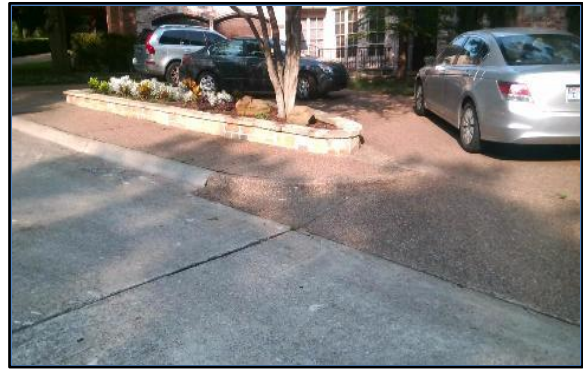
Corner 4 No Ramp (4z)