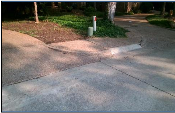
Corner 1 No Ramp (1z)