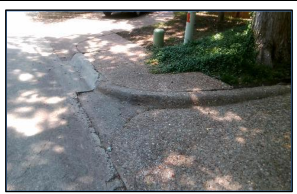
Corner 4 No Ramp (4z)