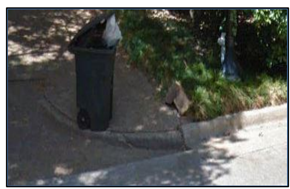
Corner 1 No Ramp (1z)