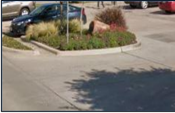
Corner 2 No Ramp (2z)