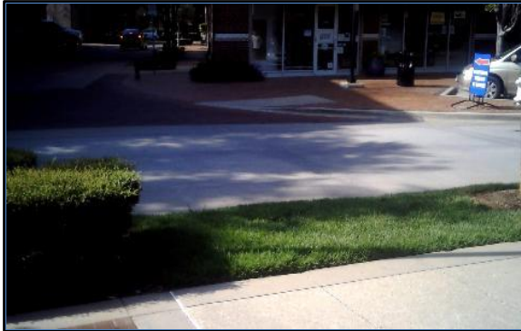
Corner 3 No Ramp (3z)