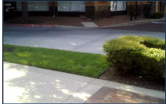
Corner 4 No Ramp (4z)