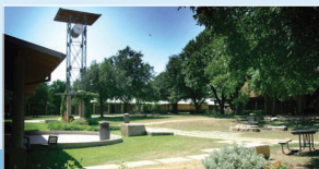
Phillip G. Foote Quadrangle, 1989, 1992 Architects: Ford Powell & Carson; Armstrong/Berger Peter G. Briggs Clock Tower, 2001 Architects: Lake/Flato