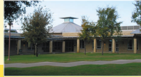
Ruth W. and Milton P. Levy Middle School, 1995 Grades 5 – 8, Rotunda, MS Office Architects: Lake/Flato (design); Hidell and Associates (project)