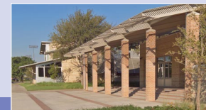
Lower School, 2005 Pre-kindergarten, Kindergarten, Primer, Grades 1-4, LS Office, Child Development Center, Extended Day, Summer on The Hill Architects: Lake/Flato (design); F&S Partners (project)