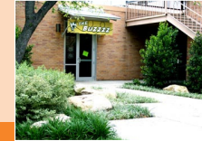
The Buzz Campus Store, 2005 Architects: F&S Partners