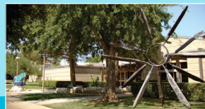
Fine and Performing Arts Center, 1973 Architects: Pratt, Box, Henderson and Partners Renovation: Hidell and Associates, 1995