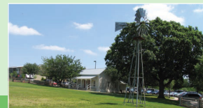
Parents' Association Farmhouse, c. 1855