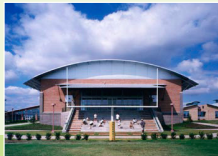
Phillips Family Athletic Center, 1998 Ginsburg Natatorium, Phillips Gymnasium, PE/Athletics Office, Greenhill Sports Center Office Architects: Lake/Flato; Hidell and Associates