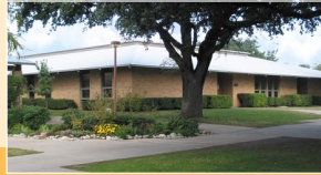
Fred & Ruth Agnich Science Hall, 1964 Architects: O'Neil Ford and Associates Renovation: Hidell and Associates, 1996