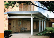
Zale-Fields Theatre, 1974 Architects: Pratt, Box, Henderson and Partners