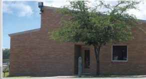
Maintenance Building, 1992 Architects: Hidell and Associates