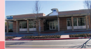
Upper School Addition, 2005 Grades 9 – 12 History & English, College Counseling, US Office Architects: Lake/Flato (design); F&S Partners (project)