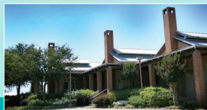
Three Chimneys Administration Building, 1995 Admissions, Advancement, Business, Head of School Architects: Lake/Flato (design); Hidell and Associates (project)