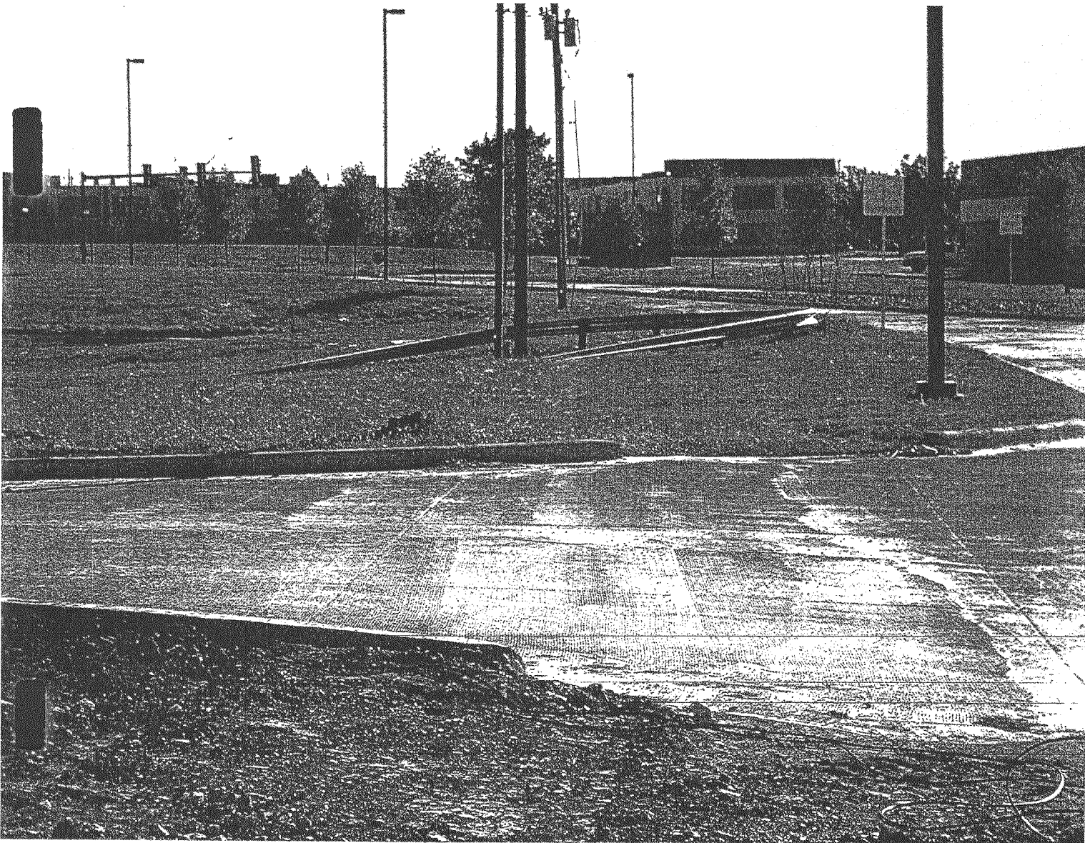
VIEW FROM PROPERTY LOOKING EAST ON ARAPAHO RD.