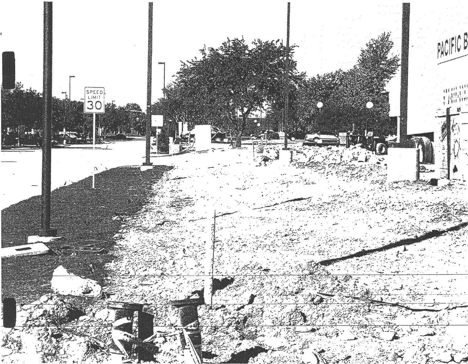
EXPANDED VIEW FROM PROPERTY LOOKING WEST ON ARAPAHO RD.