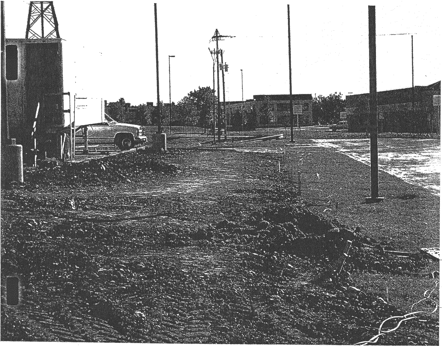
EXPANDED VIEW FROM PROPERTY LOOKING EAST ON ARAPAHO RD.