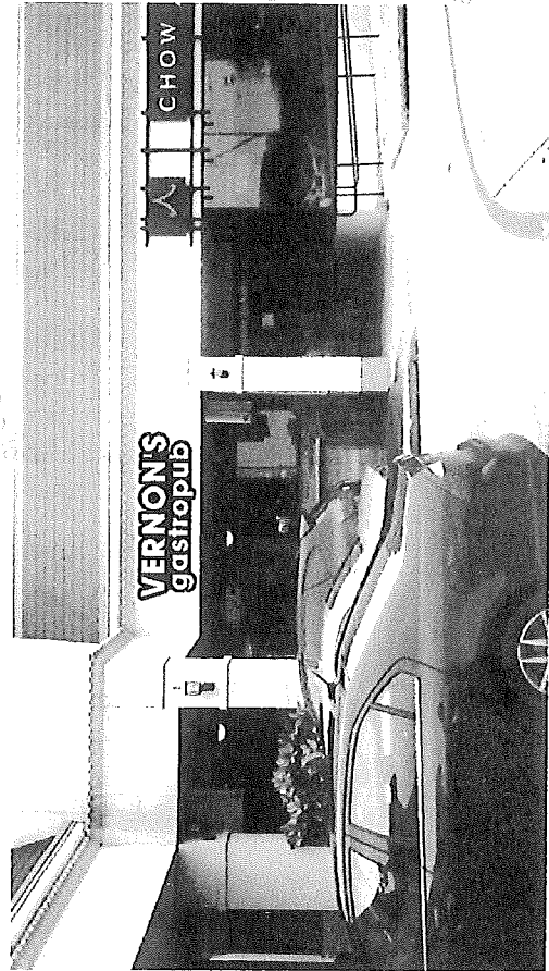
2. CHANNEL LETTERS ON BACKPLATE