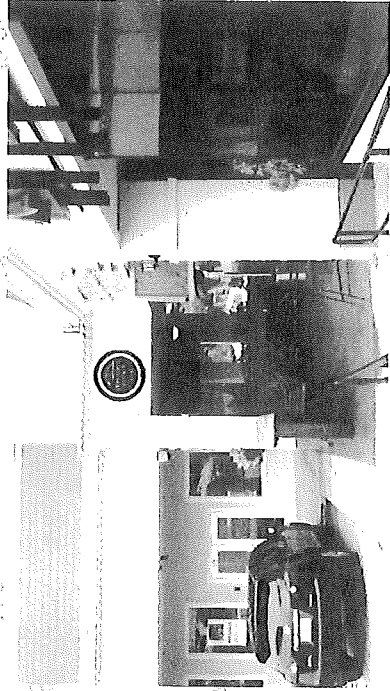
3. THREE FOOT LOGO