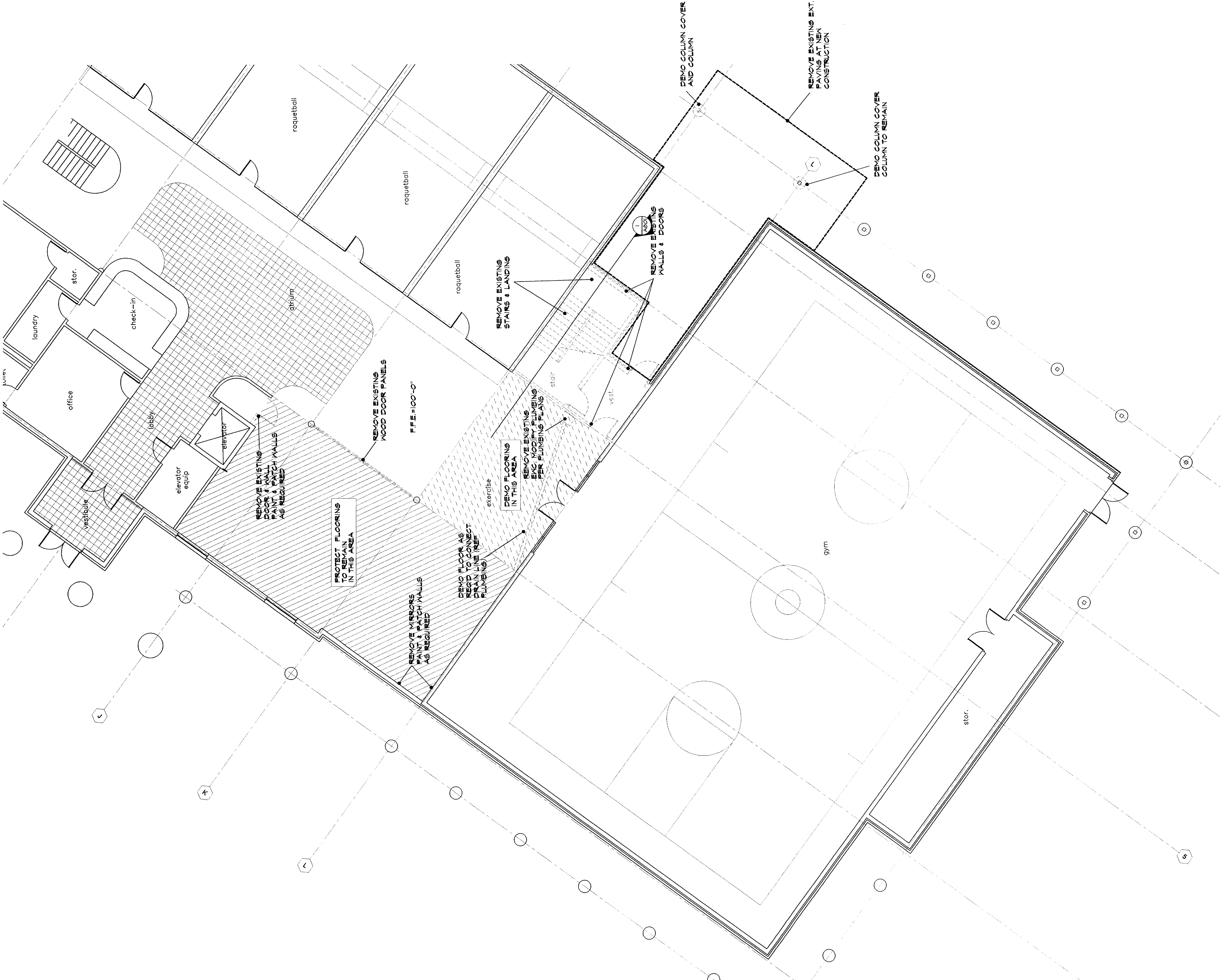
1 lower level demo floor plan 1/8" = 1'-0"