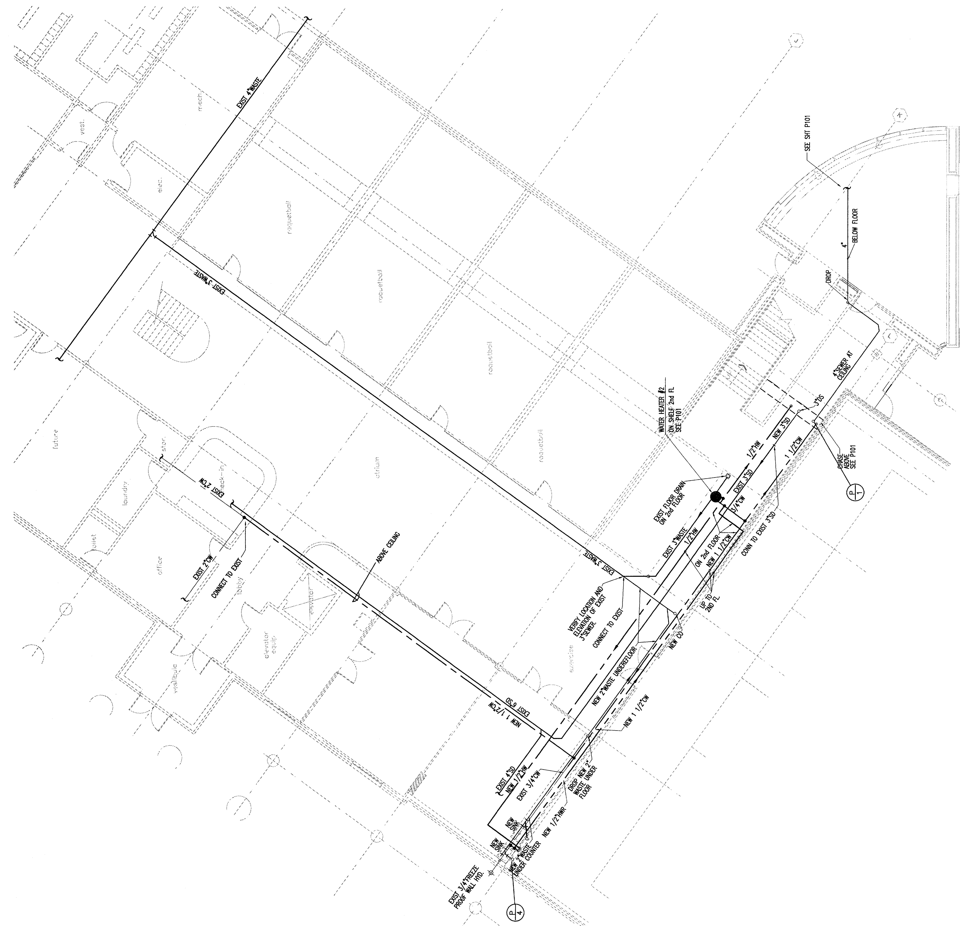
1 lower level floor plan exist building 1/8"=1'-0"