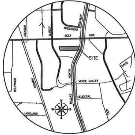
VICINITY MAP Mapaco 14-D N.T.S.