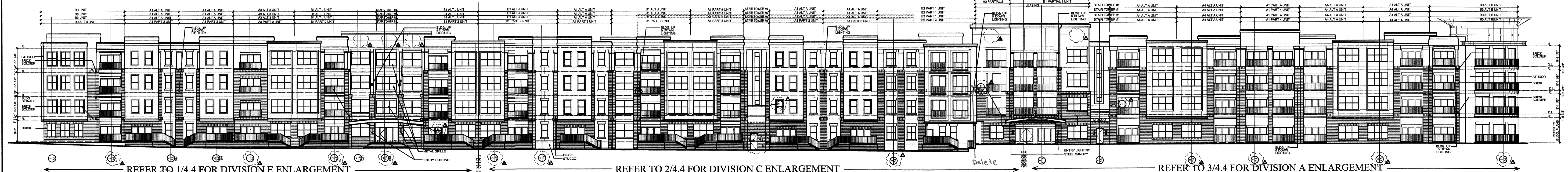
3 NORTH ELEVATION SCALE: 1"=20'-0"