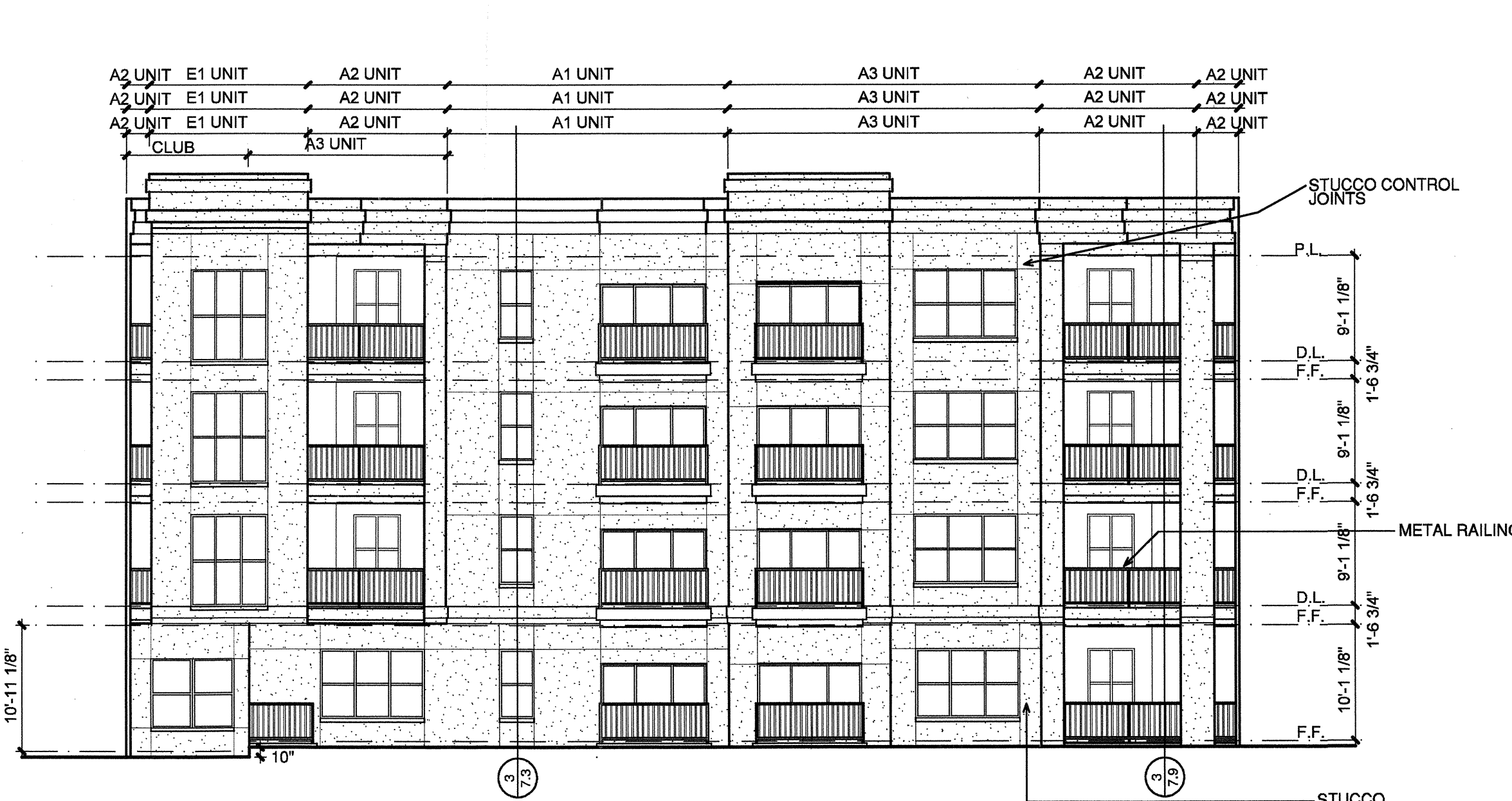
2 COURT ELEVATION SCALE: 3/32"=1'-0"