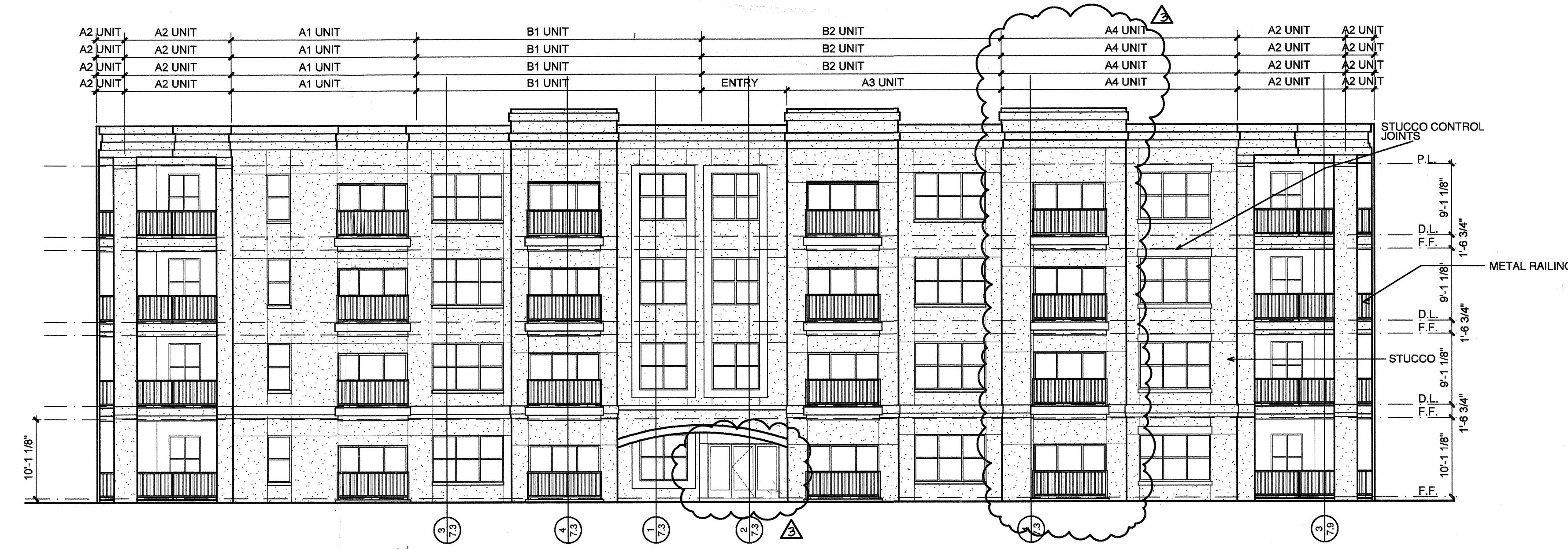
3 COURT ELEVATION SCALE: 3/32"=1'-0"