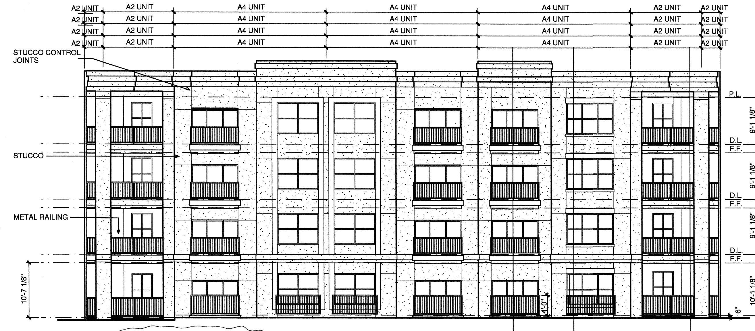
4 POOL COURTYARD ELEVATION West SCALE: 3/32"=1'-0" RFI 43