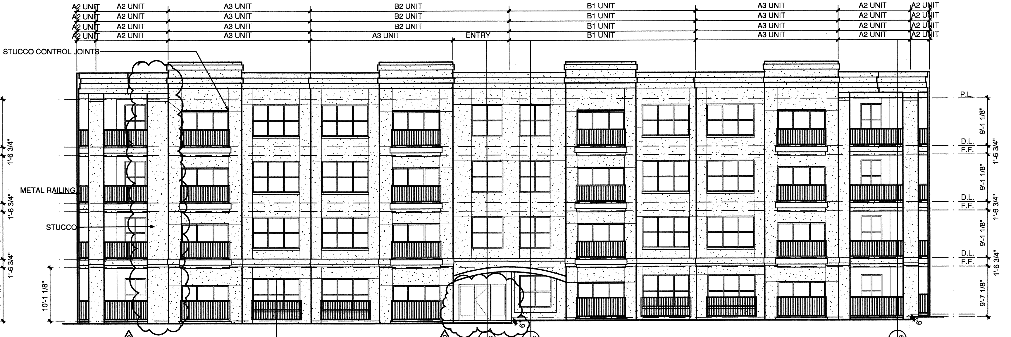
3 POOL COURTYARD ELEVATION North SCALE: 3/32"=1'-0"