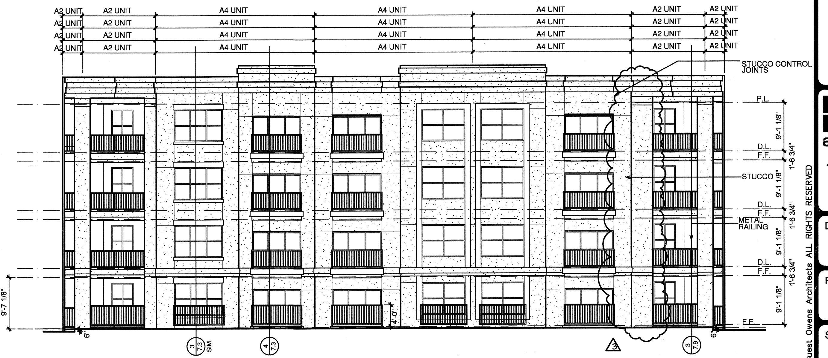
1 POOL COURTYARD ELEVATION EAST SCALE: 3/32"=1'-0"

COPYRIGHT © Beele, Guest, Owens Architects ALL RIGHTS RESERVED