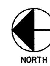
B GROUND LEVEL LIGHTING/POWER SCALE: 1/4" = 1' - 0"