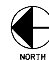
GROUND LEVEL FLOOR PLAN