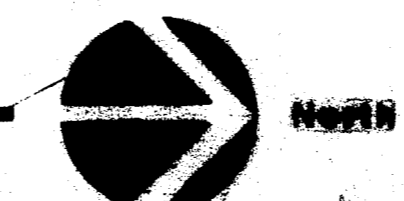
01 E2.2 FIRST FLOOR PLAN- LIGHTING

ADD ALT # - REMOVE ALL EXIST. INCANDESCENT LIGHTS IN EAST SOFFIT & REPLACE W/ TYPE 'K' FIXTURES. CIRCUIT TO H-18 VIA TIME SWITCH TO-A.