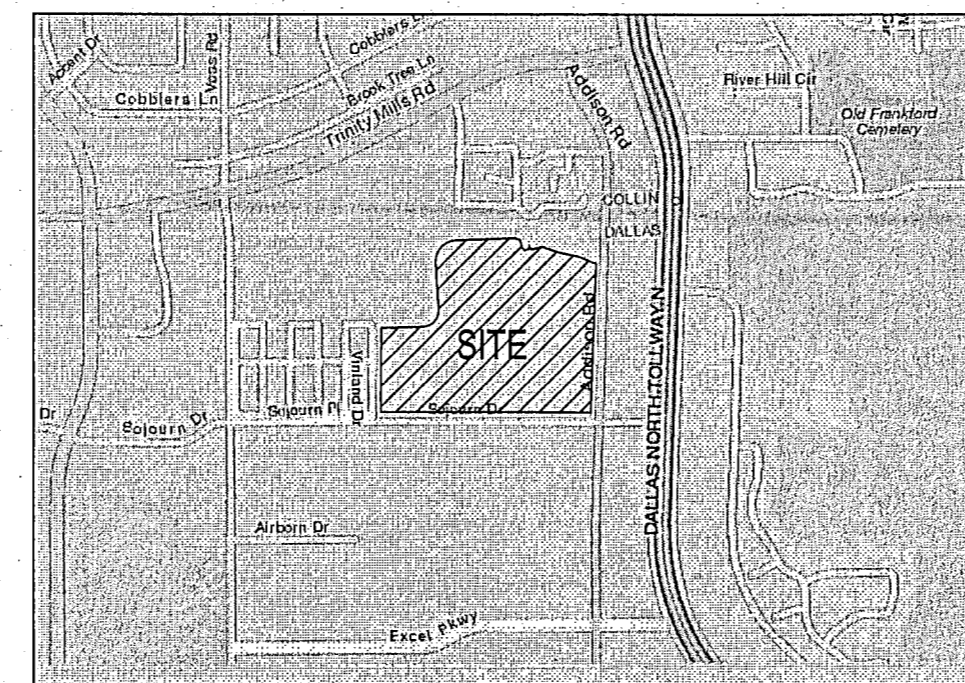
LOCATION MAP NTS

CONTRACTOR TO UTILIZE CITY APPROVED CONSTRUCTION PLANS FOR CONSTRUCTION OF ALL CIVIL RELATED FACILITIES. CONTRACTOR TO NOTIFY ARCHITECT/ENGINEER IMMEDIATELY OF ANY COST DISCREPANCIES BETWEEN THE CITY APPROVED SET AND BID SET WITH LATEST ADDENDUMS.