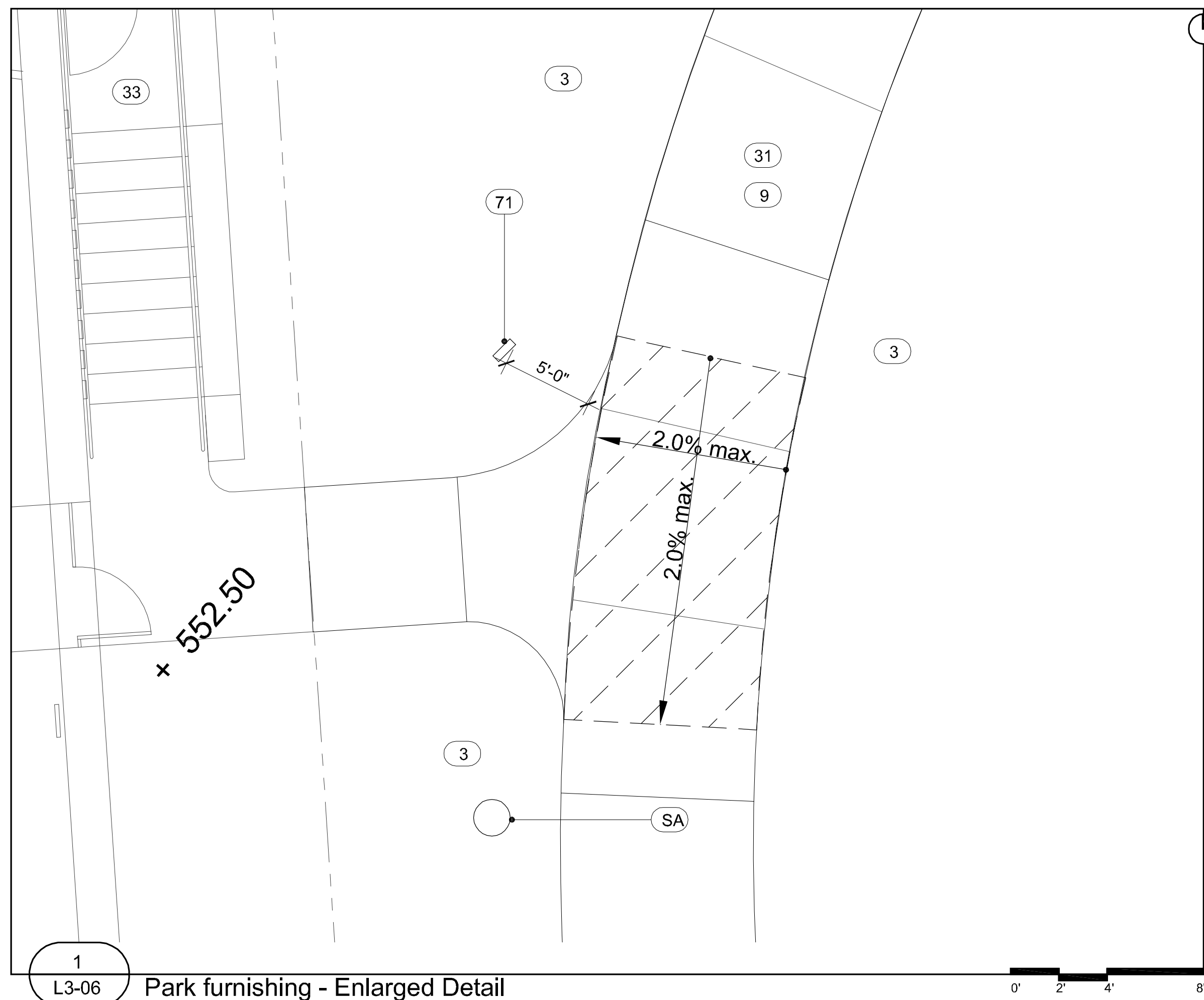
L3-06 Park furnishing - Enlarged Detail