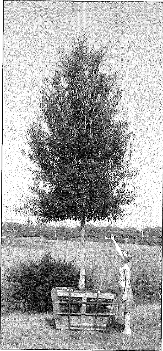
300g Highrise Live Oak