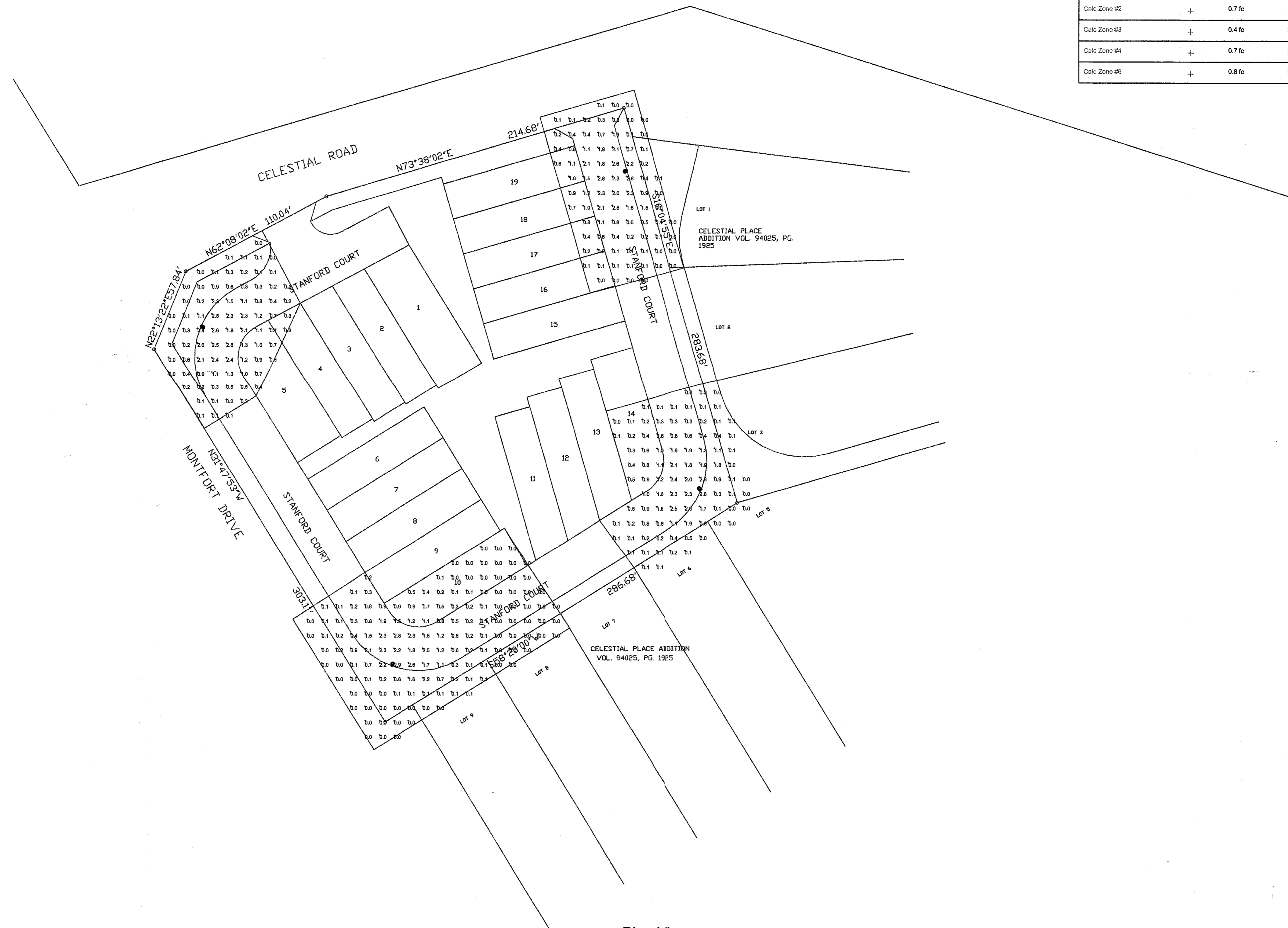
Plan View Scale 1" = 40'