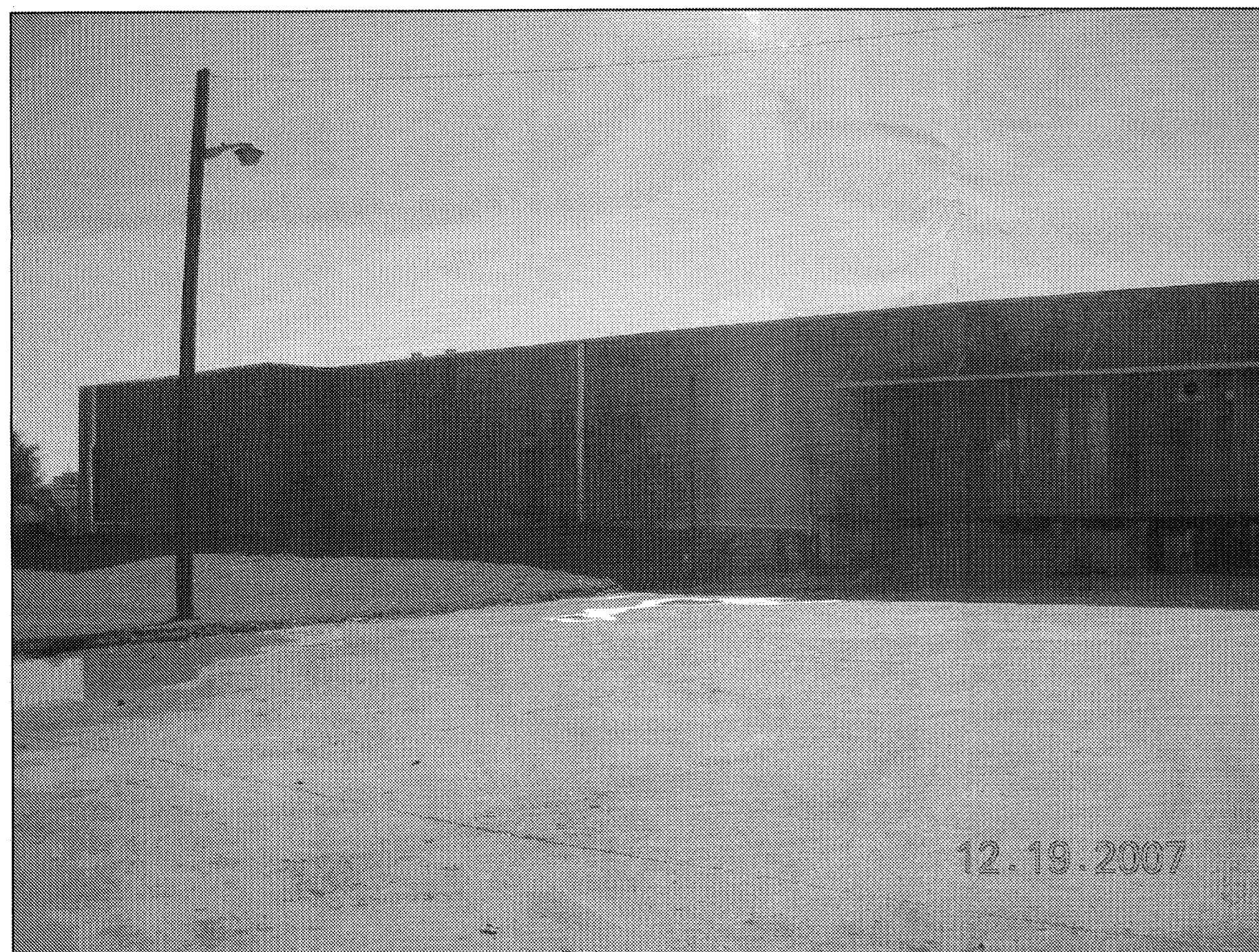
PARTIAL NORTH ELEVATION (A4) SCALE: NTS (A3.1a)