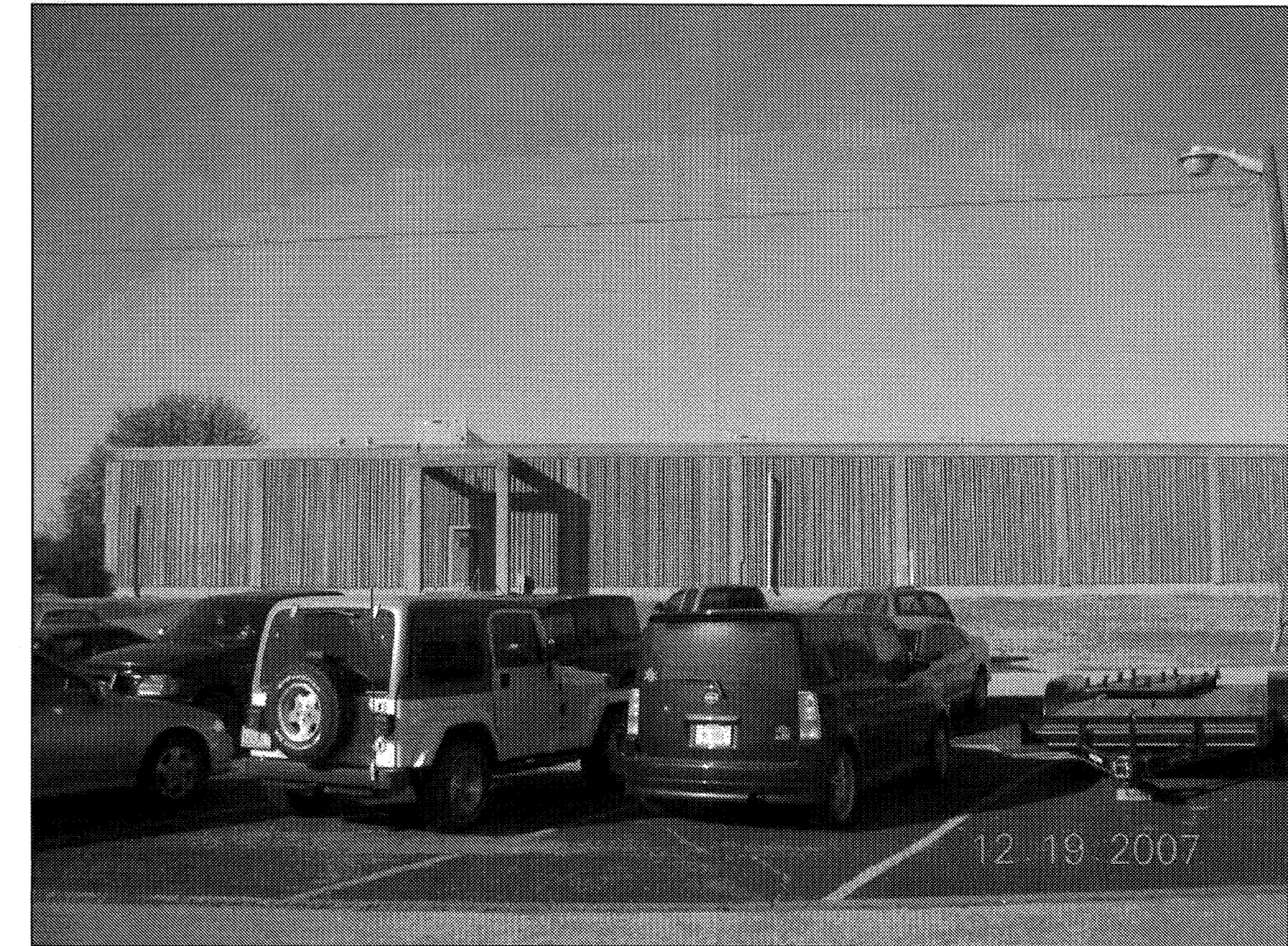
PARTIAL EAST ELEVATION (C1) SCALE: NTS (A3.1a)