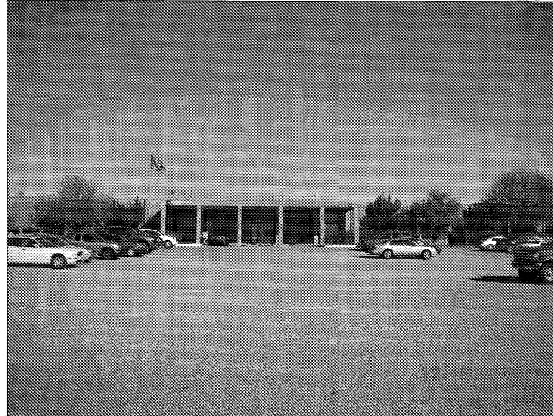
PARTIAL NORTH ELEVATION (C2) SCALE: NTS (A3.1a)