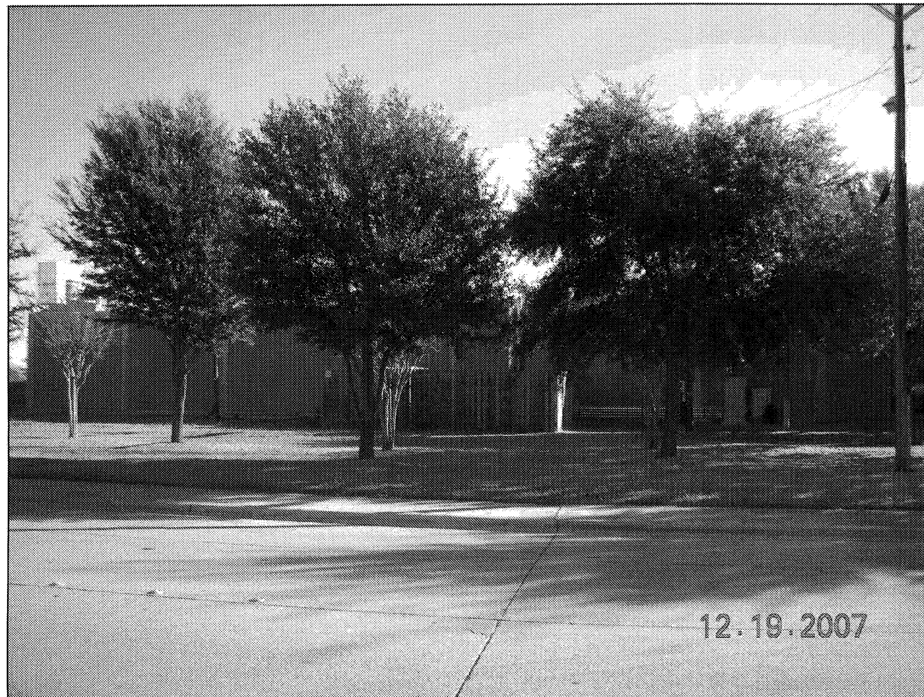
PARTIAL WEST ELEVATION (C4) SCALE: NTS (A3.1a)