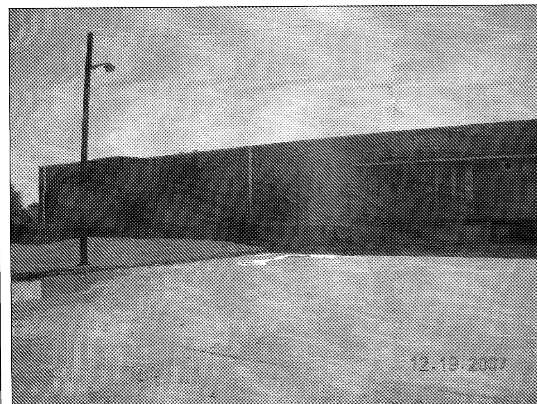
PARTIAL NORTH ELEVATION (A4) SCALE: NTS (A3.1a)