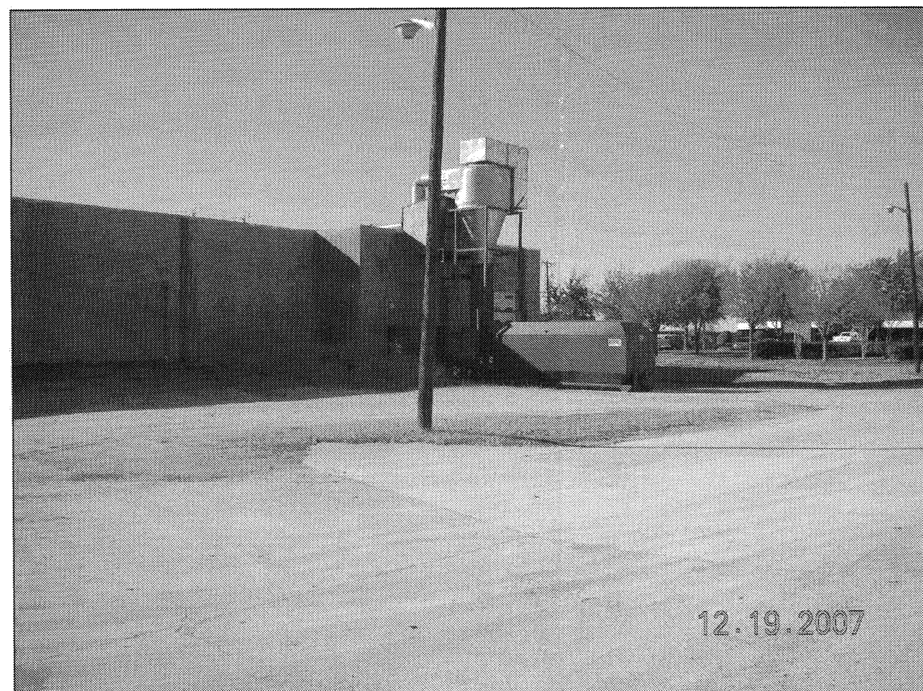
PARTIAL NORTH ELEVATION (A2) SCALE: NTS (A3.1a)