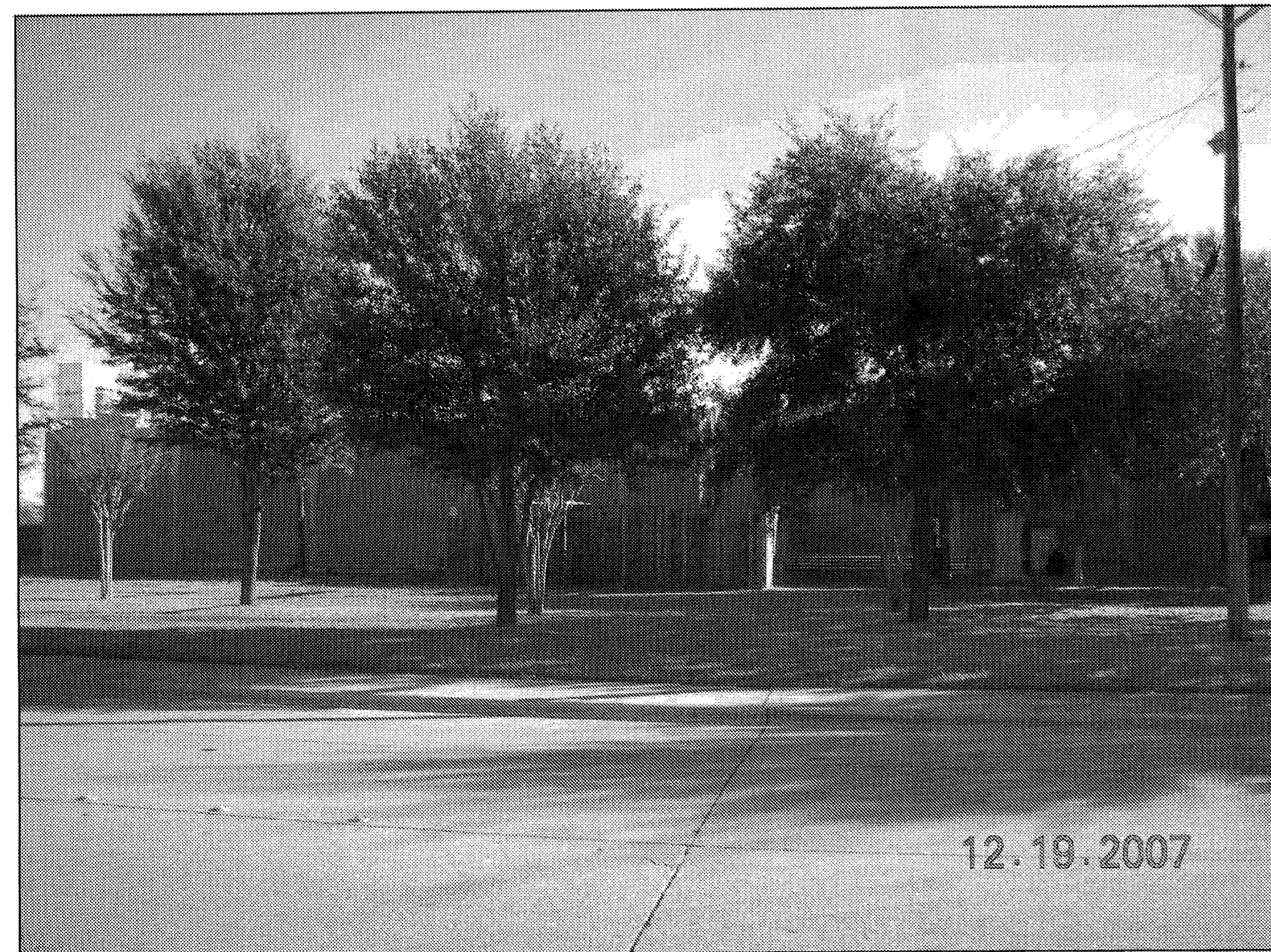
PARTIAL WEST ELEVATION (C4) SCALE: NTS (A3.1a)