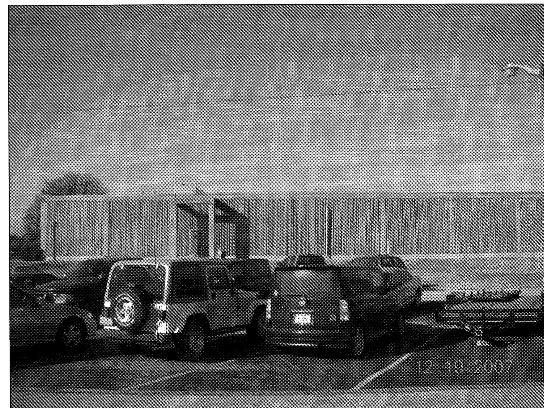
PARTIAL EAST ELEVATION (C1) SCALE: NTS (A3.1a)